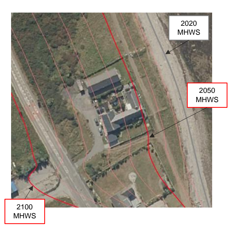
Figure 1 Exemplar location with buildings, road and associated infrastructure at risk from anticipated erosion. Grey line represents 2020 MHWS, pink lines are decadal anticipated MHWS positions from 2030 inland (right to left) with 2050 and 2100 marked in bold red. Anticipated retreat is under a high emission scenario and a 'do nothing' coastal management scenario. Indicative Results.

For the avoidance of doubt, these report the anticipated effect of future erosion under a 'do-nothing' coastal management scenario, where artificial and natural defences are not maintained. An example of the resulting output is shown in Figure 1 at a location where residential property, a roadway and a network water connection are all affected by anticipated erosion.