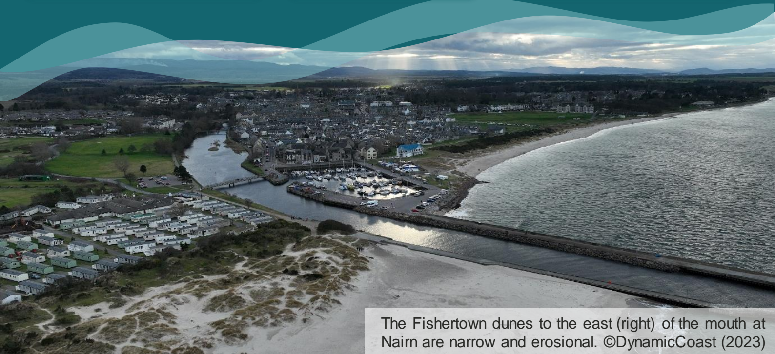
The Fishertown dunes to the east (right) of the mouth at Nairn are narrow and erosional.