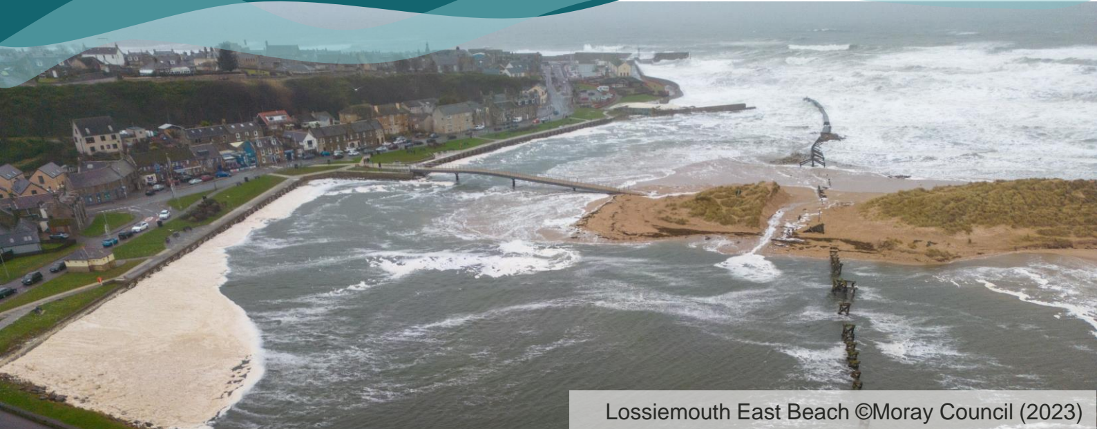
Lossiemouth East Beach