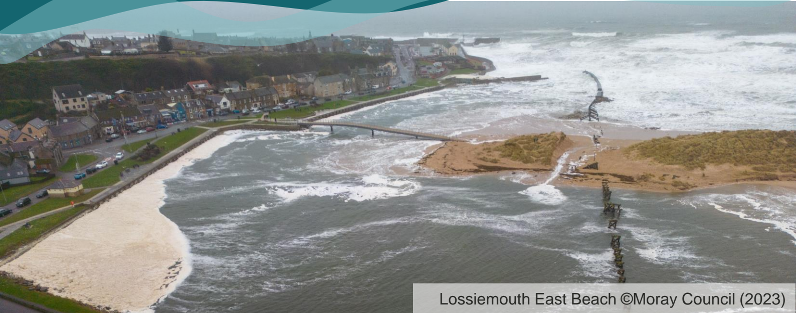
Lossiemouth East Beach